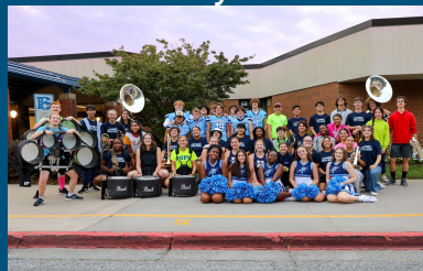
Pep Band at Elementary Schools